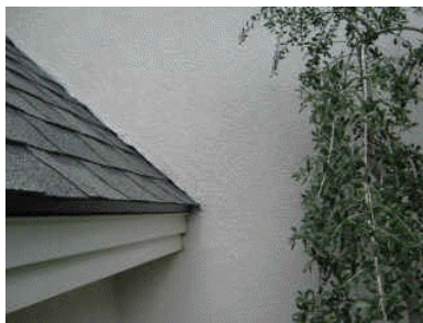
H4: Missing kickout flashing