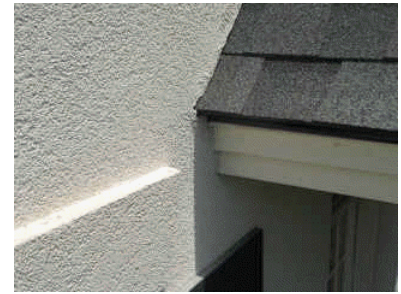
C5: Missing kickout flashing

Areas in red boxes indicate possible moisture damage to wood substrate and/or structural components. Recommend further evaluation.