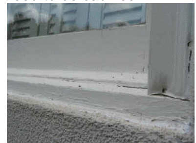
B7: Window components have moisture rot