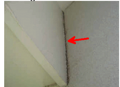
Dissembler material joints need to be caulked