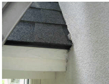
F5: Missing kickout flashing